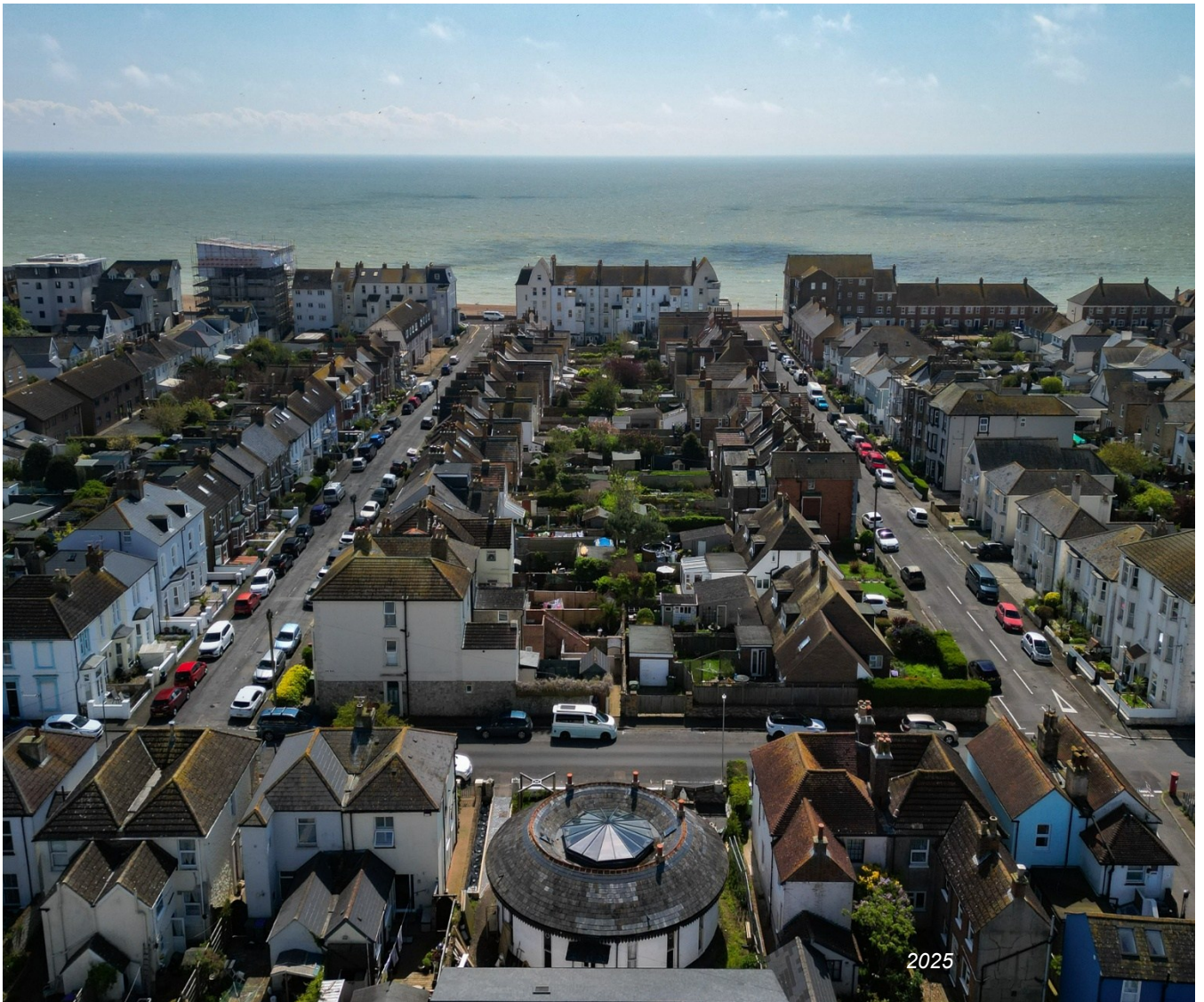
Aerial view of the Whim in Park Road with Ormonde Rd to the left and Albert Rd to the right looking ahead to the sea and West Parade.